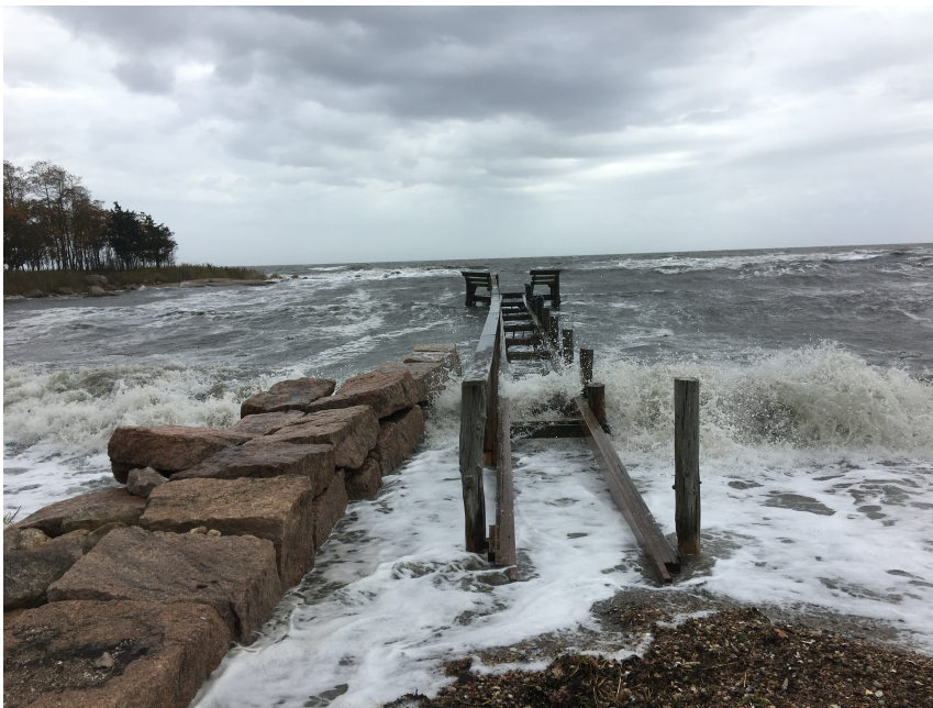
Stormy surf pounds the shoreline

Please submit any articles or family updates to Tim Chemacki for incorporation into the next issue ( preferably by email or type-written ).